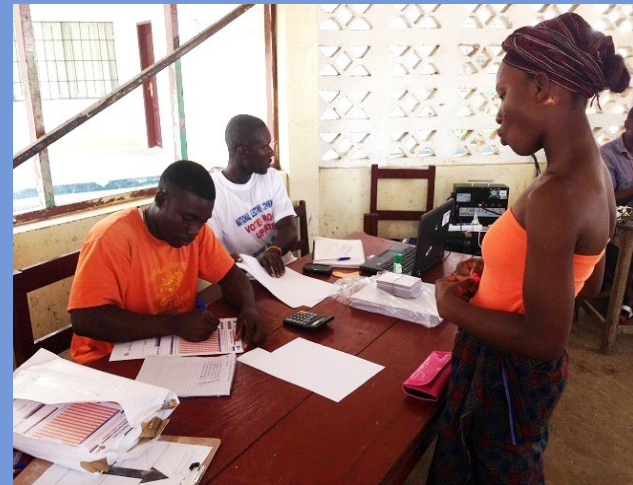
Voters' Roll Update taking place in one of 19 elections magisterial areas in Liberia

"The Commission expects that that individuals who fall within the three categories will turn out at our respective Voter Roll Update Centers in order to be included on the voters' roll" Commissioner Lansanah intimated.