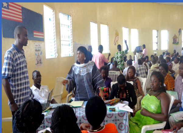
Flash Back: CRC Consultative Forum with 32 Political Parties

They are geared toward deriving proposals for amendments, which would be submitted to the National Legislature and subsequently to the voting population in a referendum for approval.